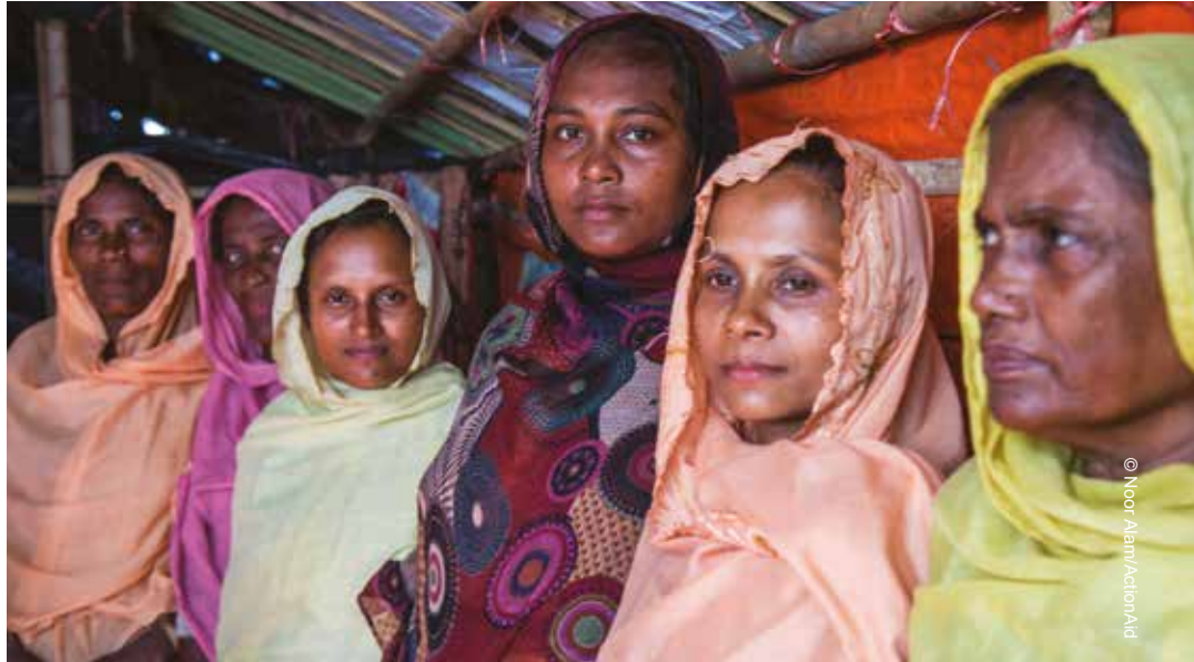
▲ ActionAid women-led committee members working together to prevent and create awareness of sanitary and health issues at Mainerghona camp, Bangladesh.

Thanks to you, we're supporting women and girls to ensure their voices are being heard.