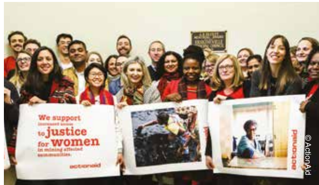
▲ Attendees gather at the assembly to stand in solidarity with women fighting for equality and justice around the world.

The assembly provides a forum for our community to get more involved in our work. It was a packed agenda, with attendees gathering to participate in round-table discussions, Q&A's, and brainstorming sessions on how we can better respond to issues affecting women around the globe.