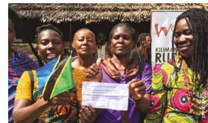
▲ Women gather at the base of Mt. Kilimanjaro to demand land rights from their governments.

Support women to lobby for policy changes on land rights across Africa.