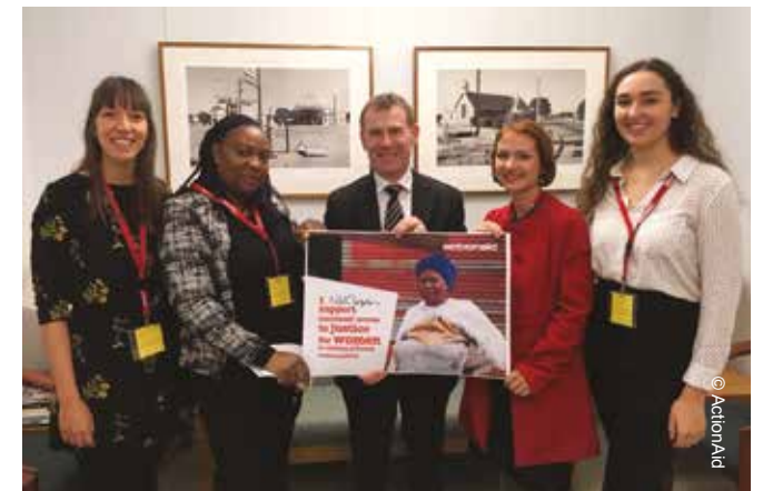
▲ Activists meeting with politicians in Canberra.