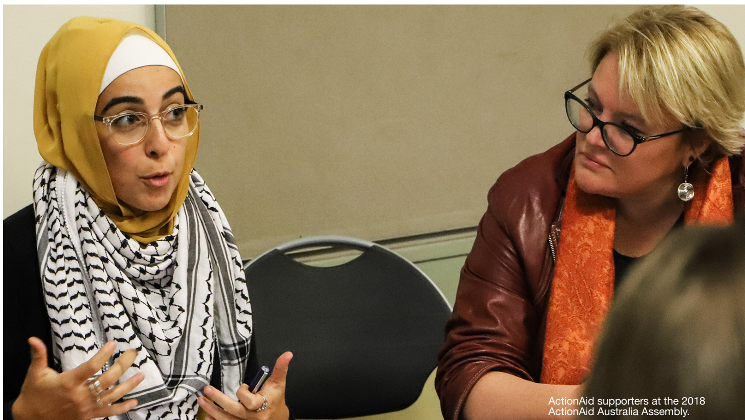
ActionAid supporters at the 2018 ActionAid Australia Assembly.

Now that you have set up a safe and inclusive environment, you can dive right into the discussion.