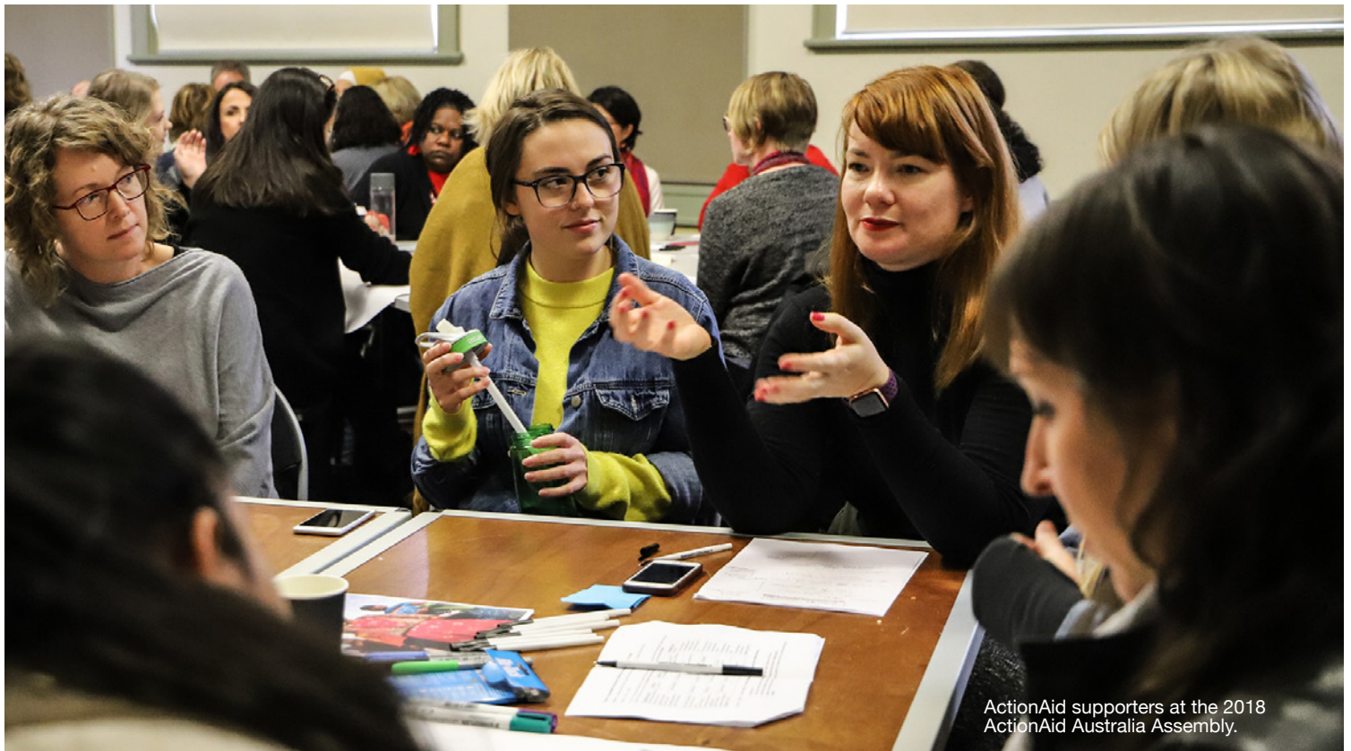
ActionAid supporters at the 2018 ActionAid Australia Assembly.

Privilege exists on a continuum with many complex dimensions. Understanding privilege is about discovering how we personally interact with our and other people's identities and dimensions of privilege. We are always interacting with these dimensions whether it's consciously or unconsciously. These can include gender, religion, socio-economic status, race, appearance, sexual orientation, ability and citizenship.