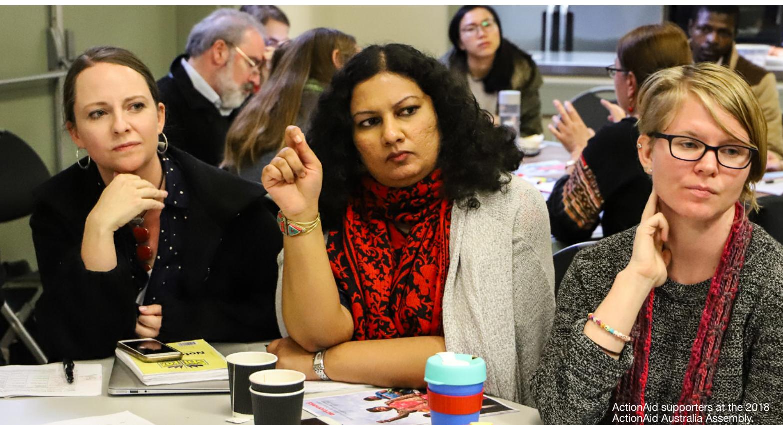
ActionAid supporters at the 2018 ActionAid Australia Assembly.