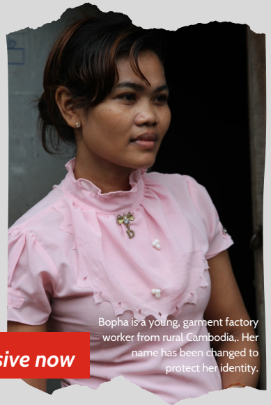
Bopha is a young, garment factory worker from rural Cambodia. Her name has been changed to protect her identity.

Mostly young migrants from poor rural areas, Phnom Penh's women garment workers struggle to cover their basic living costs on the current $100 monthly minimum wage, forcing them to work excessive overtime up to six days a week.