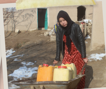
Providing emergency relief on the ground, ActionAid is distributing water, food and clothing.

ActionAid staff have set up helplines to provide up to date health advice and find hospital beds for those in need and with your support, we provided 60 oxygen concentrators to extremely vulnerable communities in regional and rural India.