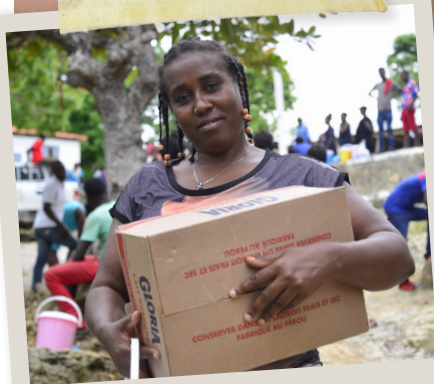
ActionAid staff have been distributing relief kits containing essential items like food, hygiene kits and soap.