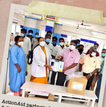
ActionAid partnered with SmartAid to deliver 60 oxygen concentrators.

ActionAid is responding on the ground providing immediate support through shelter, protection, cash and food assistance.