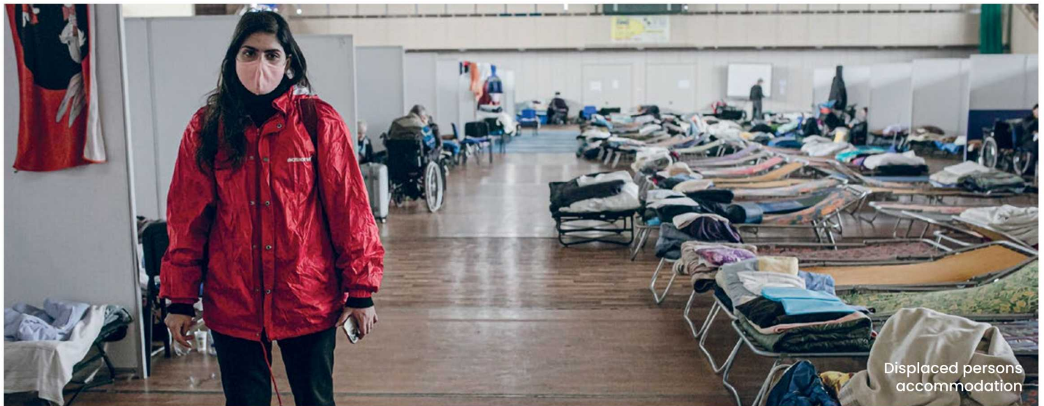
Displaced persons accommodation