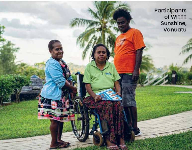
Participants of WITT Sunshine, Vanuatu