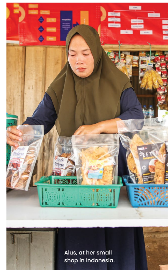
Alus, at her small shop in Indonesia.

Women, including young women, have been empowered to act as focal points in their village for disaster preparedness, gender-based violence case management and livelihood activities.