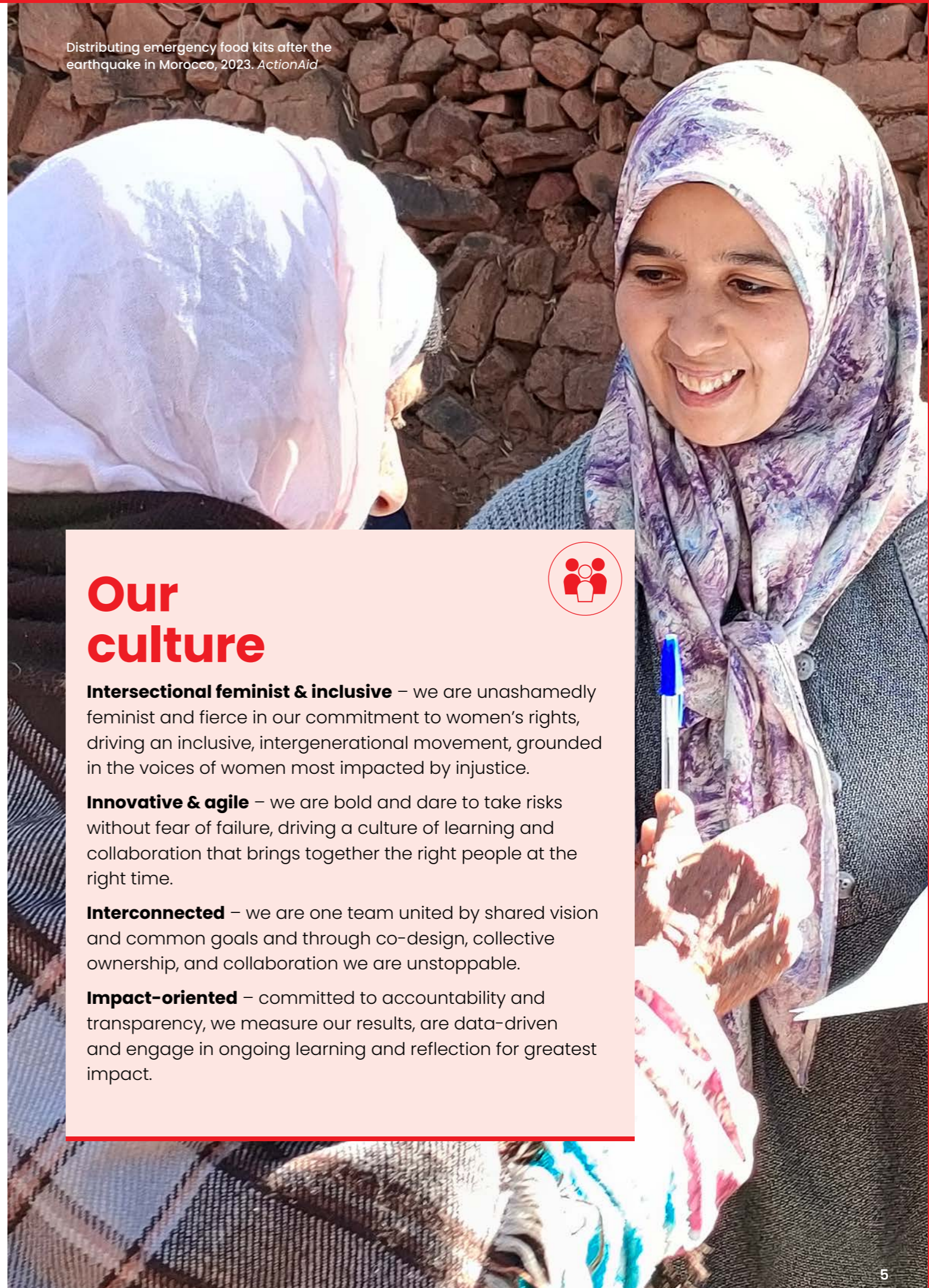
Distributing emergency food kits after the earthquake in Morocco, 2023. ActionAid

Impact-oriented – committed to accountability and transparency, we measure our results, are data-driven and engage in ongoing learning and reflection for greatest impact.