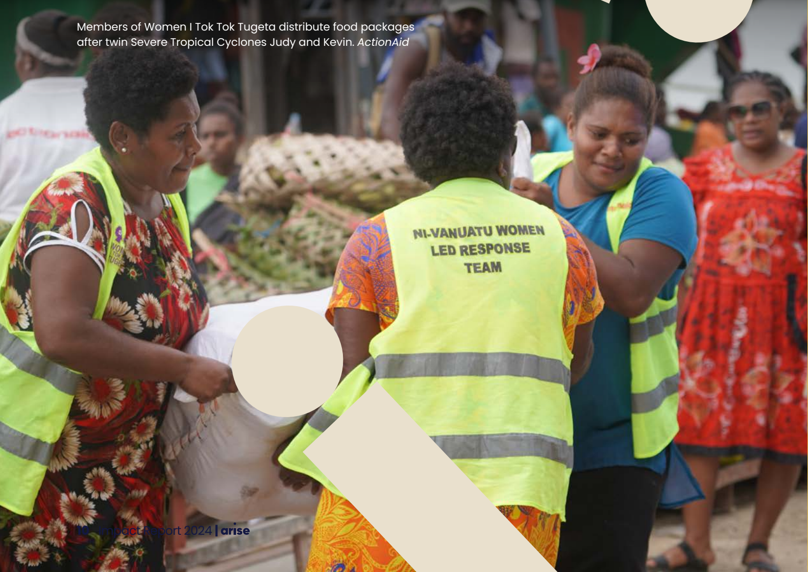
Members of Women I Tok Tok Tugeta distribute food packages after twin Severe Tropical Cyclones Judy and Kevin.