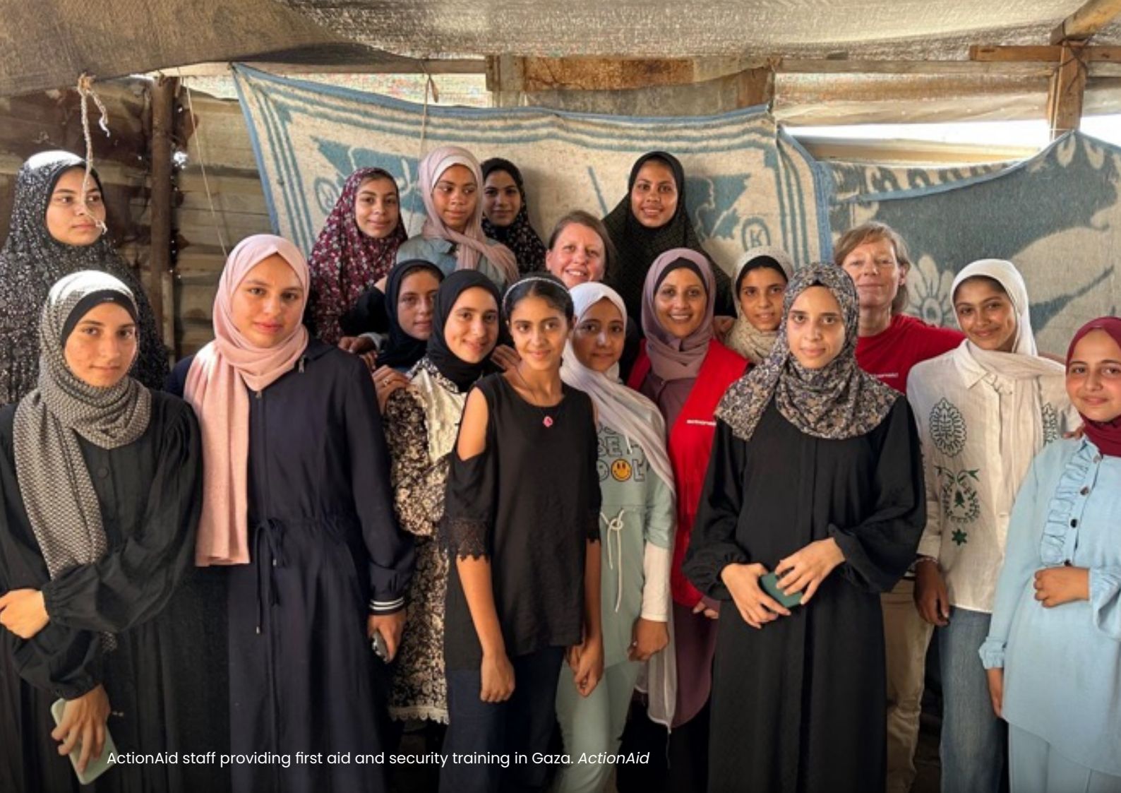
ActionAid staff providing first aid and security training in Gaza.