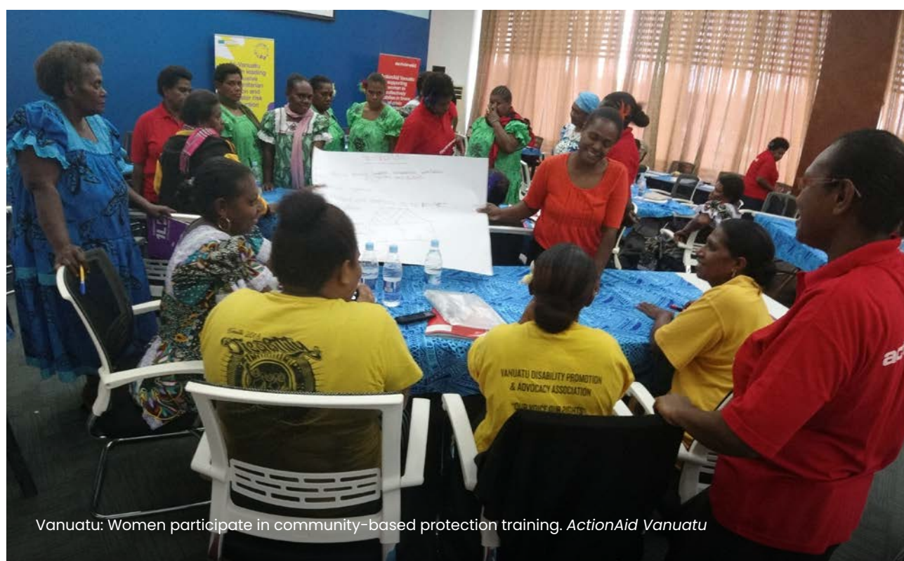
Vanuatu: Women participate in community-based protection training. ActionAid Vanuatu