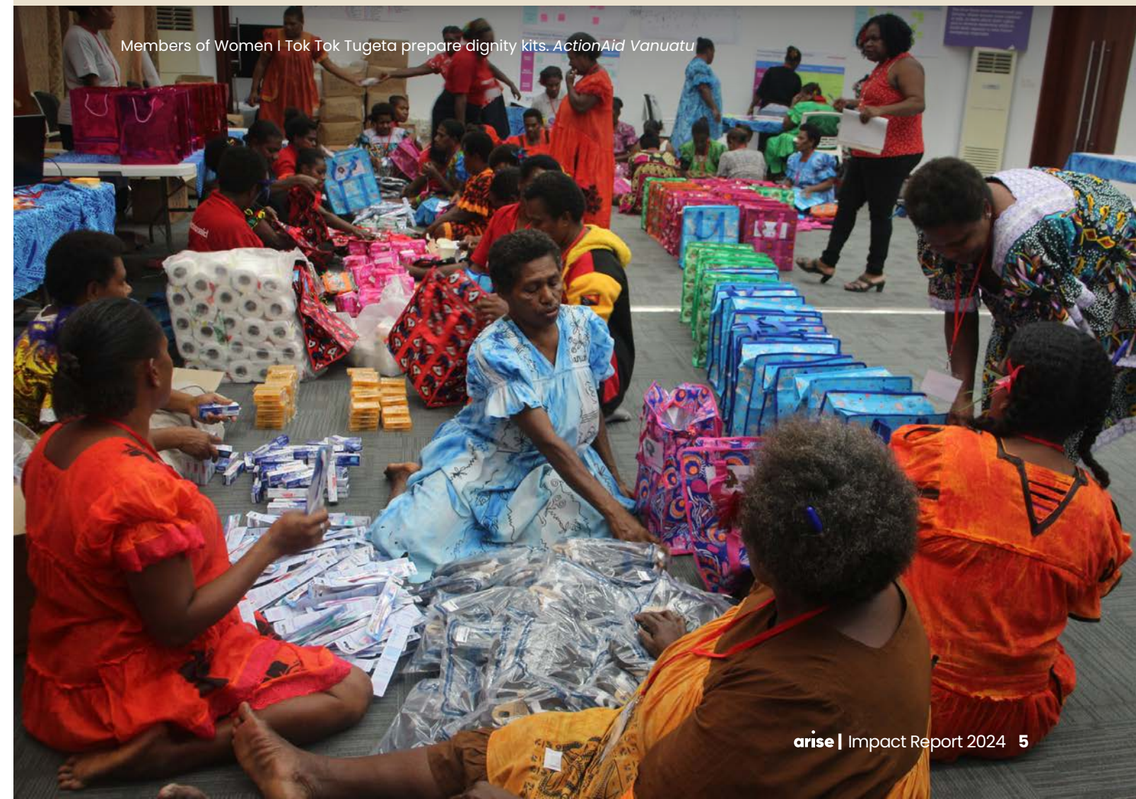
Members of Women I Tok Tok Tugeta prepare dignity kits. ActionAid Vanuatu