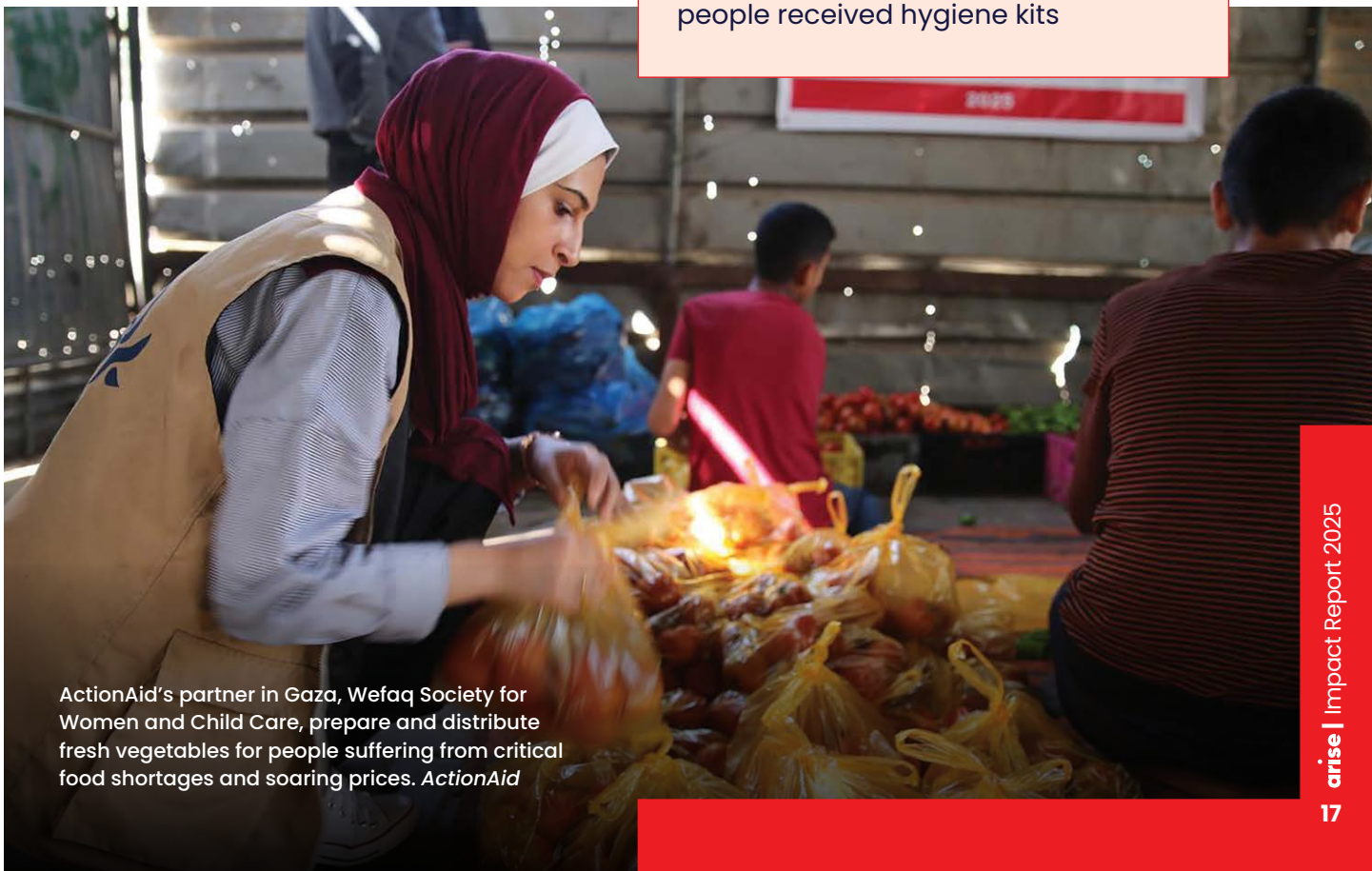
ActionAid’s partner in Gaza, Wefaq Society for Women and Child Care, prepare and distribute fresh vegetables for people suffering from critical food shortages and soaring prices. ActionAid